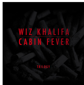
Wiz Khalifa Cabin Fever Triple LP