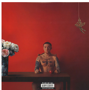
Mac Miller Watching Movies With the Sound Off