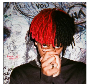
DC The Don Come As You Are Bundle